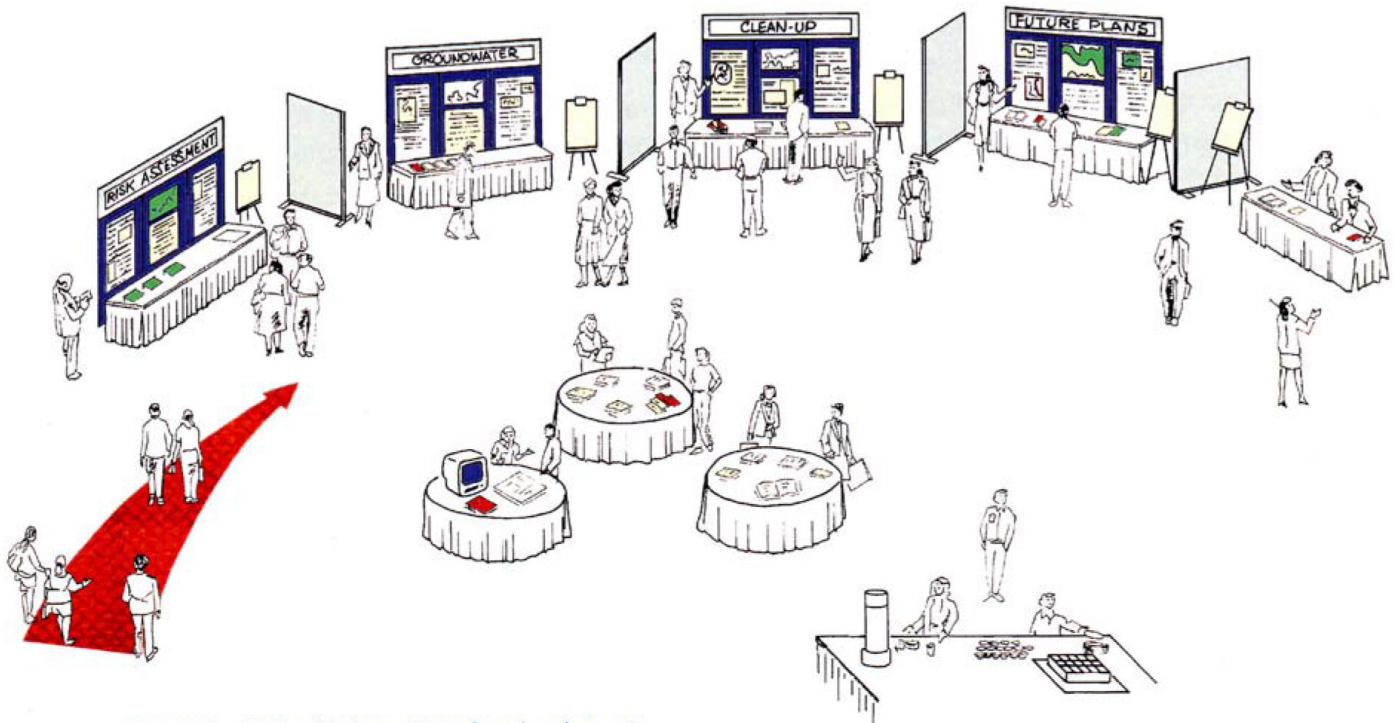
Figure 1. Typical Information Session Layout

before developing materials to present at your information session or selecting your 'subject matter experts' to man your displays. There is much to be considered and understood about message development, messenger selection and preparation before effectively providing information to the public or other concerned audiences. Please contact NMCPHC for more assistance or more information.